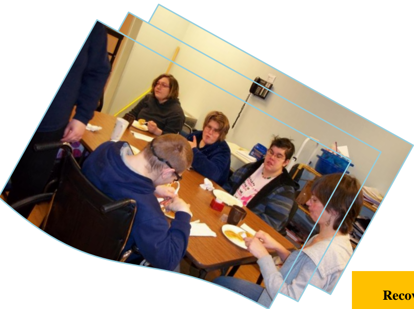
Recovering from a night of fun!