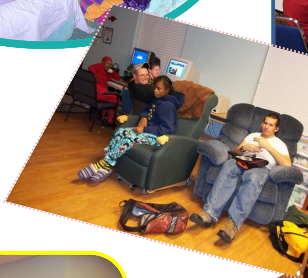
Hanging Out and Monkeying Around