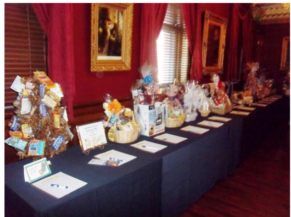
Table with some of the items for the Silent Auction

dFs is now on Facebook: visit us at www.facebook.com/diversifiedfamily