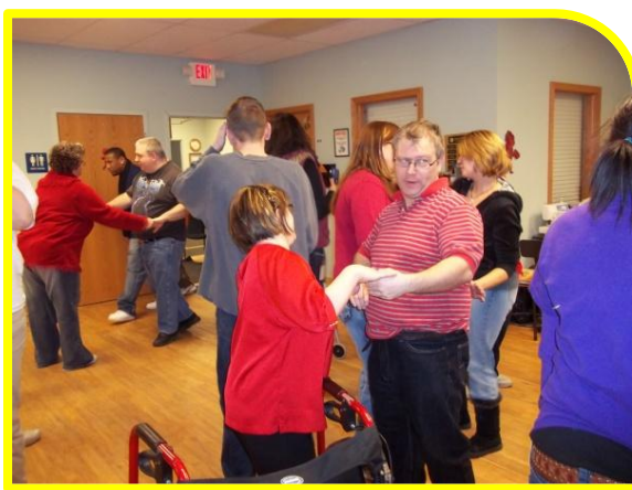
Dance to the Music