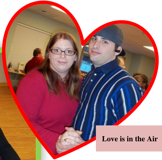
Love is in the Air